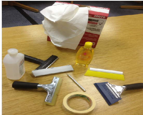
Figure 1: Cleaning and Installation Tools for MACtac SAG films