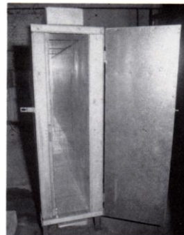
Curing oven at Vista Color Lab, Cleveland, Ohio, is big enough to handle the largest sheets of plastic being used.