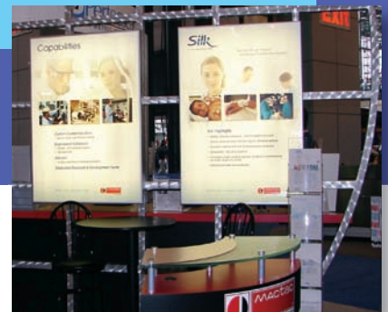
Backlit panels are a feature of trade show displays

NEW PERMACOLOR® Because your image is everything