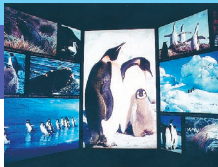
Larger than life transparencies create awesome museum displays