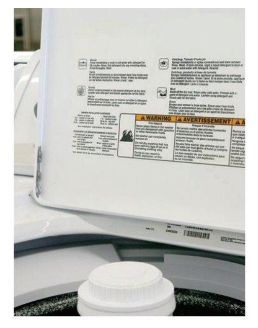
UL labels specific to indoor use products must withstand 72 hours at 23+2 degrees Celsius, 50+5%RH; water immersion for 48 hours at 23 degrees Celsius; and, 10 days in an air oven with temperatures at 20 to 30 degrees Celsius higher than rating temperature