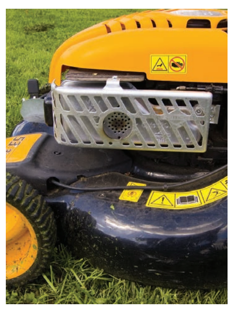
UL labels specific to outdoor use products must withstand 7 hours in a low temperature cold box at a temperature of -23 degrees Celsius or lower; 750-hour UV and water exposure; and various immersions